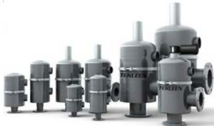
Automatic, self-cleaning water filters and strainers. Accredited with NSF-61 Certification for drinking water.