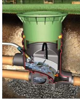
Collection Tanks; Rainwater Pre-filtration