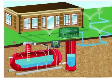
Collection Tanks; Rainwater Pre-filtration

Rainwater Harvesting Systems; Storage Containers; Water Treatment; Distribution Pumps & Pressure Tanks